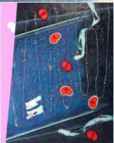
D-brane α 2008.3, oil on canvas, 130.3 × 162.0cm