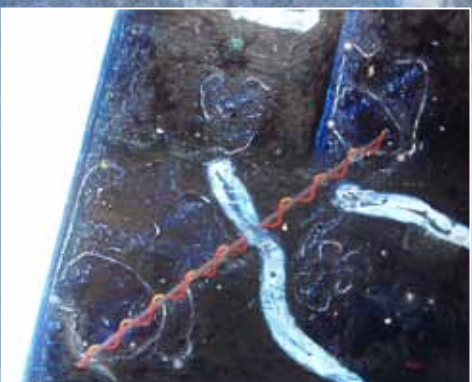
D-brane 2007.7, oil on canvas, 162.0 × 130.3cm