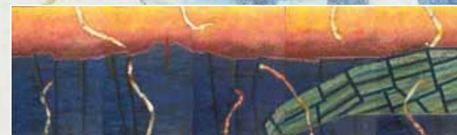
Scope 2010.12, oil on canvas, 72.7 × 303cm