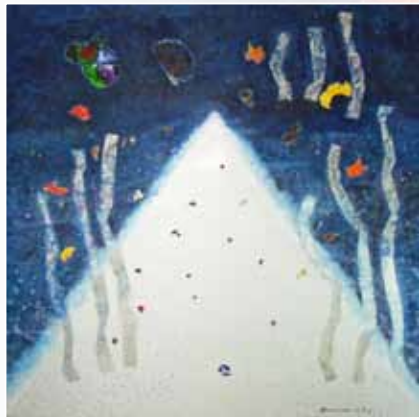
B(a)ondage 4 2012.2, acrylic on curtain, 160 × 180cm