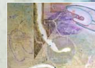
The Universe sheet (宇宙面) 1, 2, 2007.5, oil on canvas, 72.7 × 53.0cm

POSTAL EXHIBITION 紙田 彰, KAMITA Akira, June, 2012.