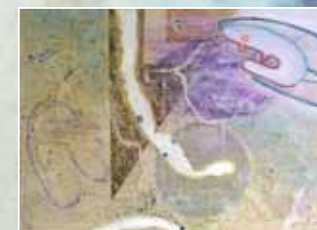
The Universe sheet (宇宙面) 1, 2, 2007.5, oil on canvas, 72.7 × 53.0cm

POSTAL EXHIBITION 紙田 彰, KAMITA Akira, June, 2012.