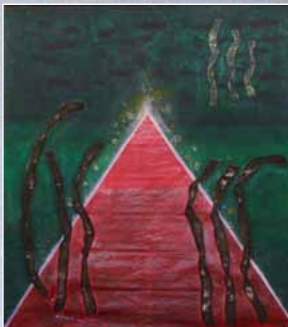
B(a)ondage 3 2011.10, acrylic, bandage on curtain, 160 × 180cm