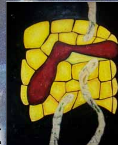
The ambition and desire, of DNA life system (DNA 生命体の野望と欲望) I 2010.2, oil on canvas, 130.3.3 × 106cm