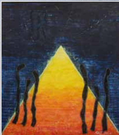
B(a)ondage 2 2011.3, acrylic, bandage on curtain, 160 × 180cm