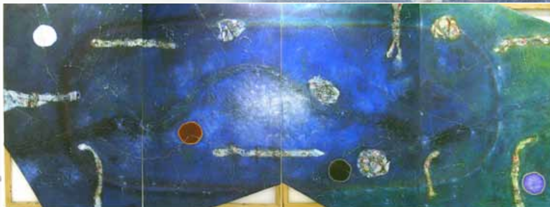
10 44 sec.—Generating of gravity (重力の発生) 2006.10-11, oil on canvas, 521.2 × 194.0cm Open work in Yokohama BankArt studio NYK