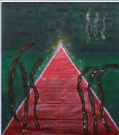
B(a)ondage 3 2011.10, acrylic, bandage on curtain, 160 × 180cm