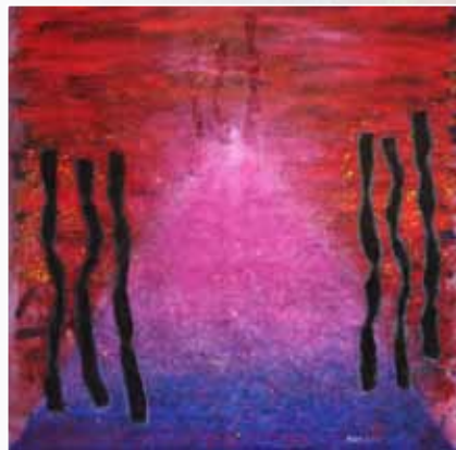
B(a)ondage 1 2011.1, acrylic, bandage on curtain, 180 × 180cm